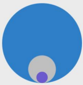
Hotels Chalets/second homes B&B/youth hostels/campsites